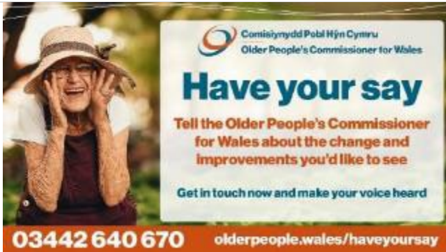
Image of older woman calling out alongside text that reads: Have your say. Tell the Older People's Commissioner for Wales about the change and improvements you'd like to see. Get in touch now and make your voice heard