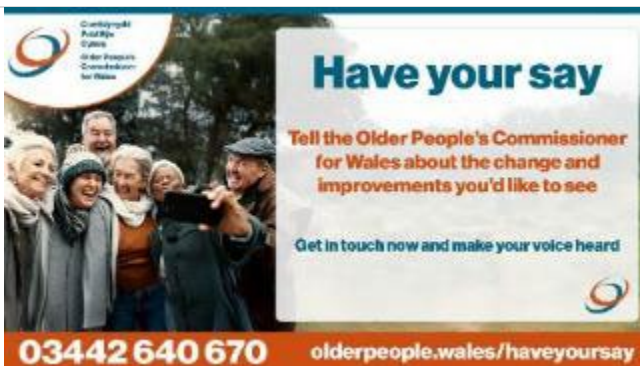
Image of group of older people taking a selfie alongside text that reads: Have your say. Tell the Older People's Commissioner for Wales about the change and improvements you'd like to see. Get in touch now and make your voice heard

Image of paper cutouts of Wales and two speech bubbles alongside text that reads: Have your say. Tell the Older People's Commissioner for Wales about the change and improvements you'd like to see. Get in touch now and make your voice heard