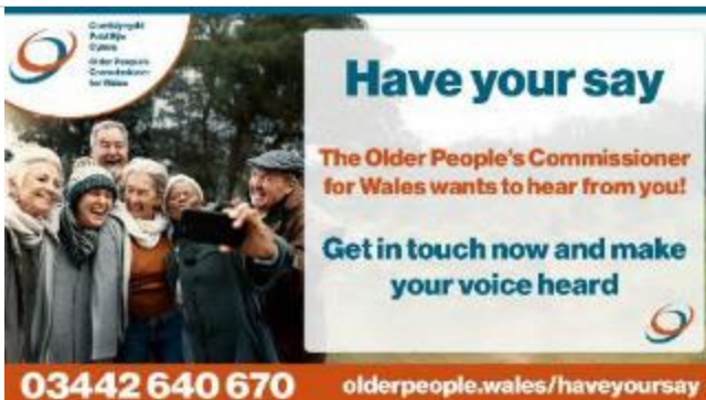
Image of group of older people taking a selfie alongside text that reads: Have your say. The Older People's Commissioner for Wales wants to hear from you! Get in touch now and make your voice heard

Image of paper cutouts of Wales and two speech bubbles alongside text that reads: Have your say. The Older People's Commissioner for Wales wants to hear from you! Get in touch now and make your voice heard