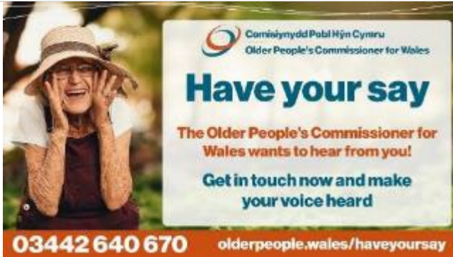
Image of older woman calling out alongside text that reads: Have your say. The Older People's Commissioner for Wales wants to hear from you! Get in touch now and make your voice heard