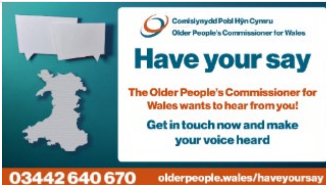
Image of paper cutouts of Wales and two speech bubbles alongside text that reads: Have your say. The Older People's Commissioner for Wales wants to hear from you! Get in touch now and make your voice heard

Image of older woman calling out alongside text that reads: Have your say. The Older People's Commissioner for Wales wants to hear from you! Get in touch now and make your voice heard