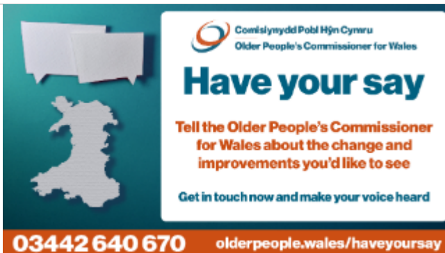
Image of paper cutouts of Wales and two speech bubbles alongside text that reads: Have your say. Tell the Older People's Commissioner for Wales about the change and improvements you'd like to see. Get in touch now and make your voice heard

Image of older woman calling out alongside text that reads: Have your say. Tell the Older People's Commissioner for Wales about the change and improvements you'd like to see. Get in touch now and make your voice heard