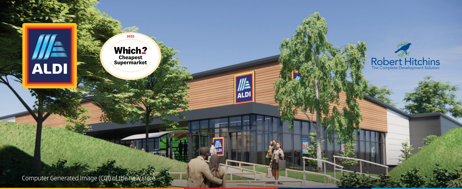
Computer Generated Image (CGI) of the new store.